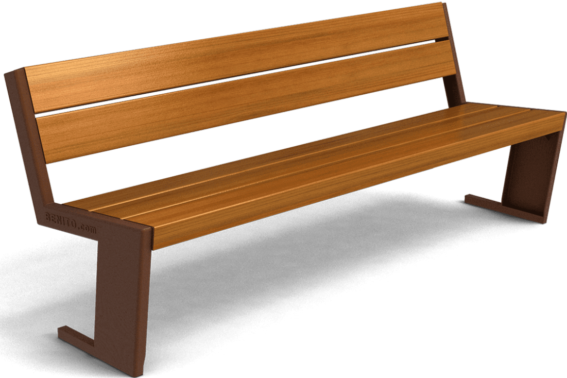
Quatro S UM377SM