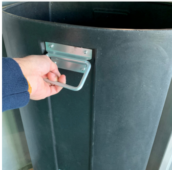
120-L capacity inner bucket made of polyethylene with two handles to ease garbage removal.