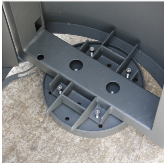
Cigarette butt extinguisher in the lid.