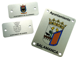
Aluminum plate 74 x 35 / 80 x 100 mm

Recommended anchoring: by means four M8 expansion bolts depending on the surface and the project. The bin includes an innovative levelling system for inclined installations.