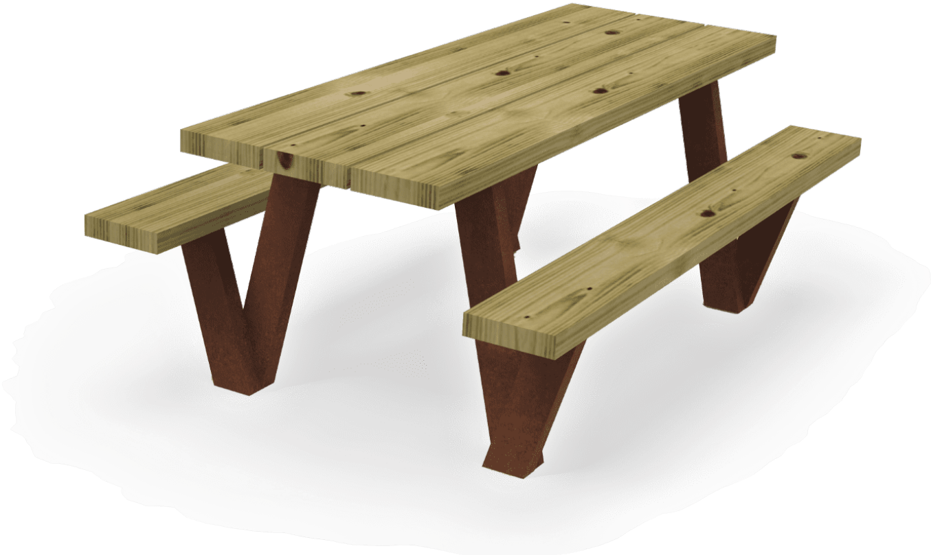
Table made with 50 x 100 mm corten steel tubular legs. 210 x 50 mm pine wood board streated in vacuum pressure autoclave Class IV against woodworm, termites and insects. Stainless steel screws.

Recommended anchoring: embeddable base with concrete.