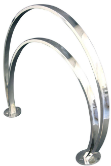
Bike Rack in stainless steel (VBO11).

The Ferrus treatment consists of three layers that are applied after cleaning all dirt and impurities by shot blasting and consists of an electrolytic bath, followed by a layer of epoxy primer and a final coating of polyester powder paint in grey RAL 9006. Recommended anchoring: By means of 4 M8 expansion bolts, depending on the surface and project.