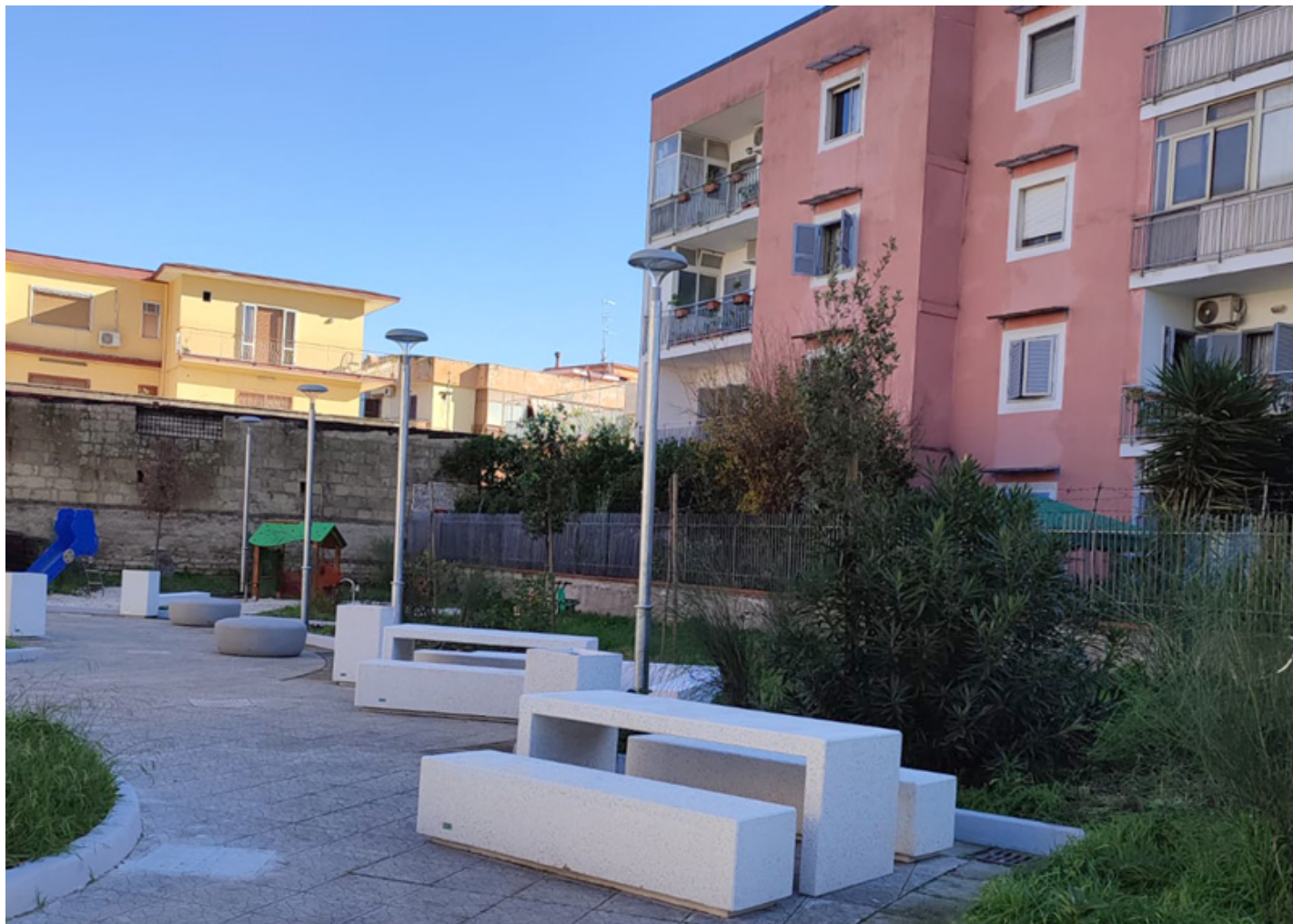
Citizen Clear ILCZ0

Casavatore, a municipality located in the Metropolitan City of Naples, has opted for BENITO products.