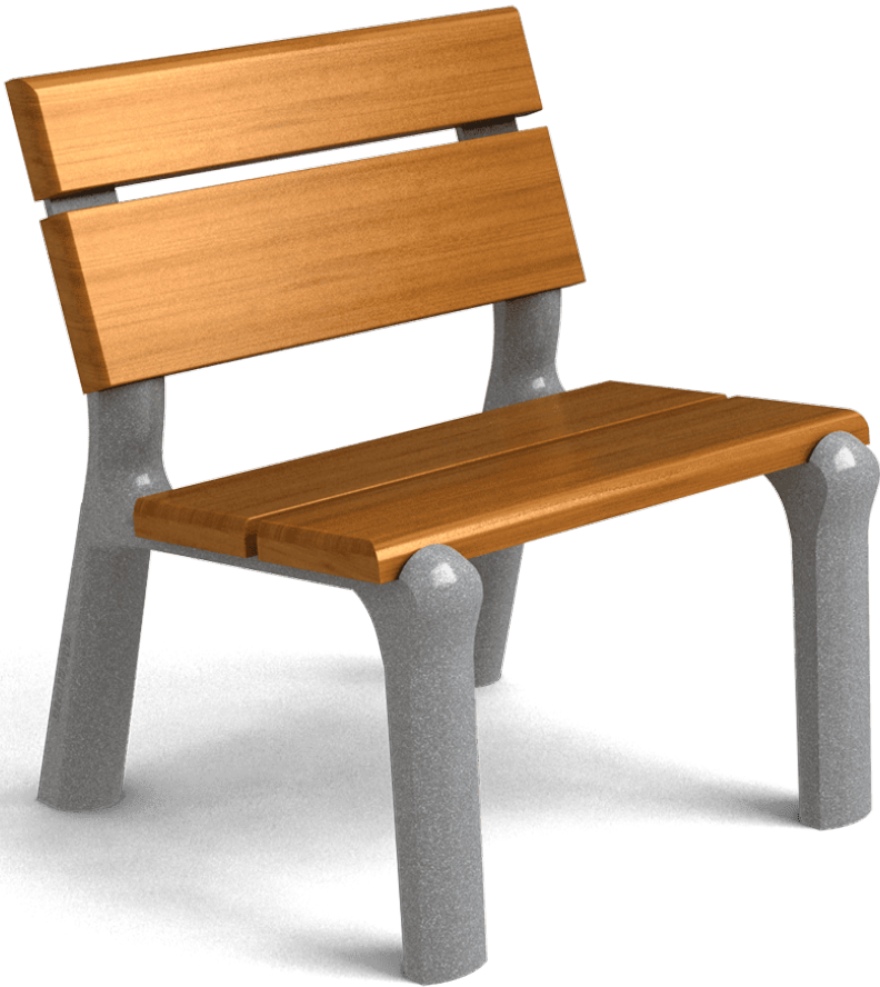
Delta XXI UM363W