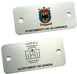
Aluminium plate 74 x 35 mm.

Recommended anchoring: by means of M10 expansion bolts depending on the surface and the project.