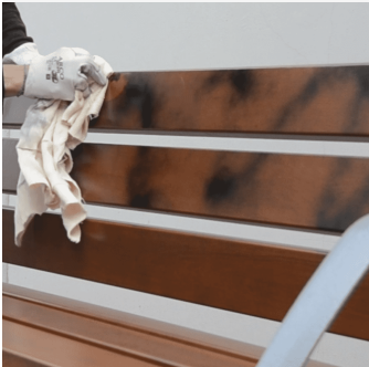
Protector for materials from paints, graffiti ....