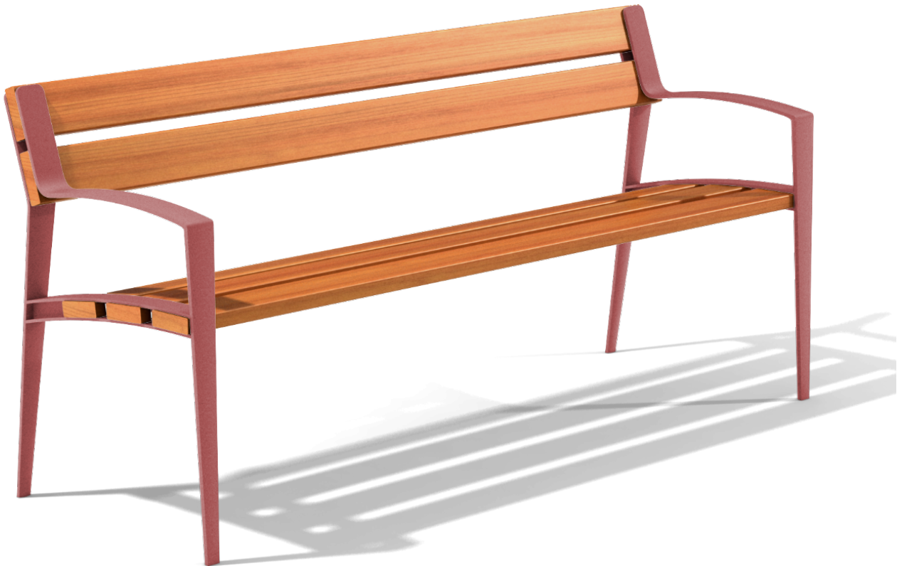
Mielek SR PA691SR